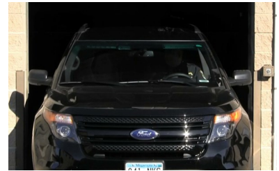
Narrow police garage door