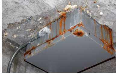
Deteriorating parking ramp