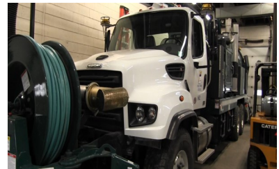
Larger equipment makes for unsafe quarters